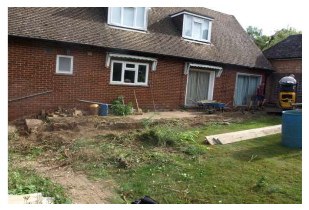
Plate 1 – Location of Trench 1- breaking out concrete (looking NE)