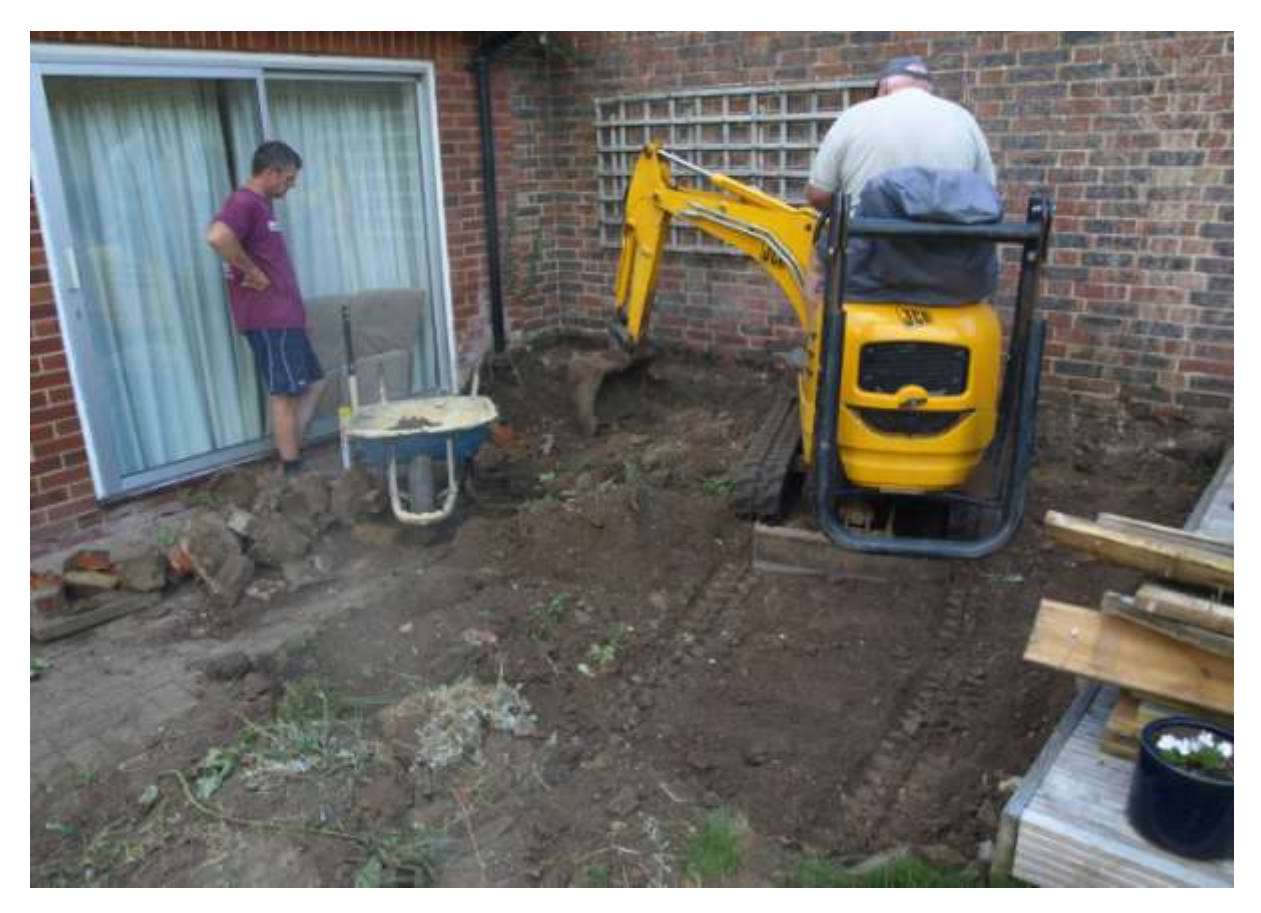
Plate 2. Trench 1. Watching Brief strip of dwarf wall and flagstones (looking NW)