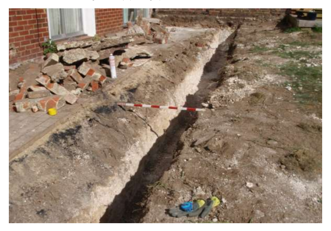
Plate 3 – Trench 1 Watching Brief strip (looking E)

Plate 2. Trench 1. Watching Brief strip of dwarf wall and flagstones (looking NW)