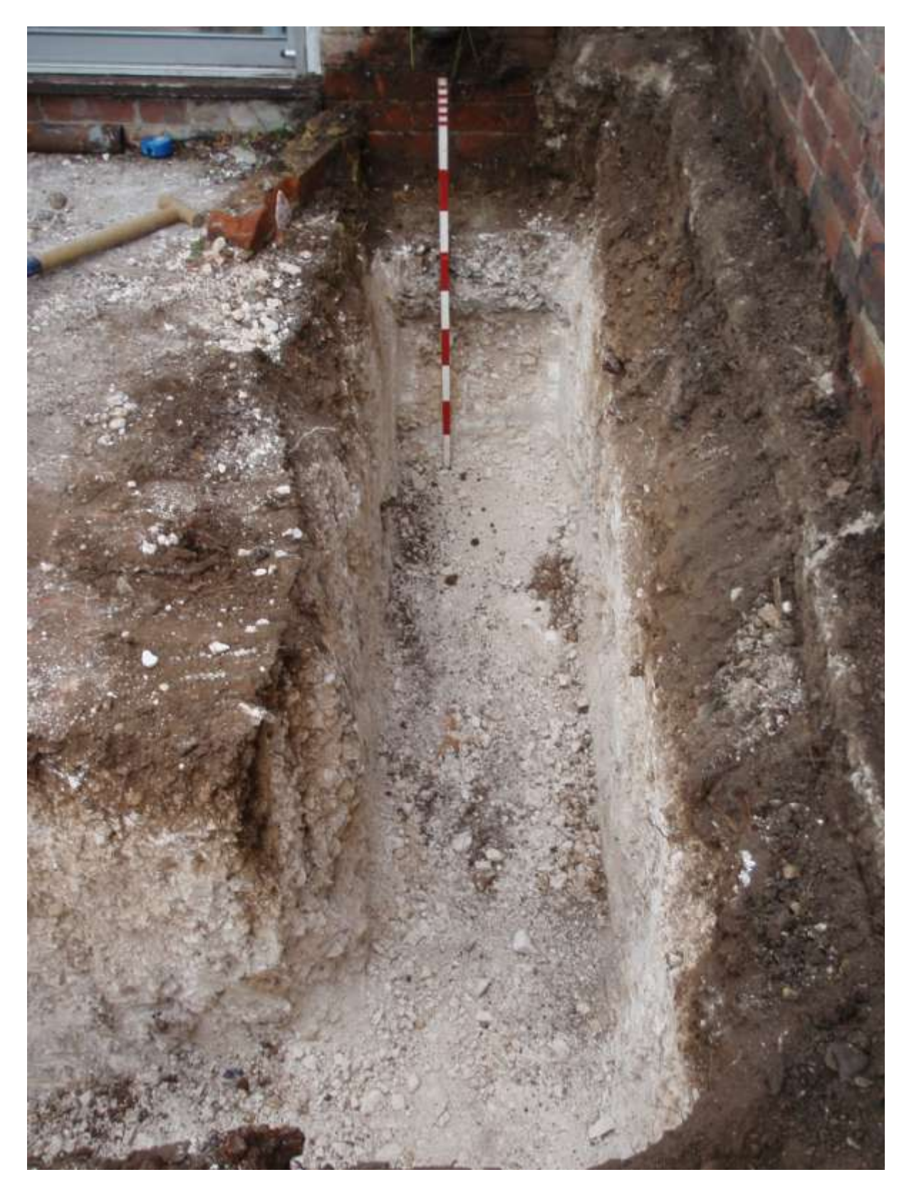
Plate 7. Trench 1- section (looking W)