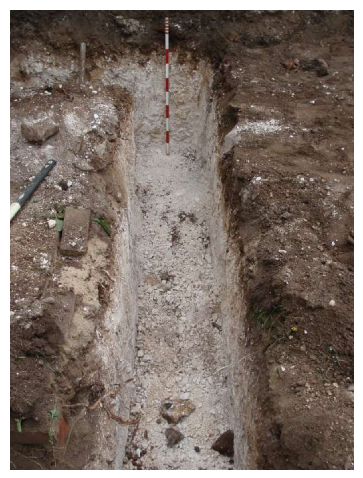
Plate 6. Trench 1- section (looking E)