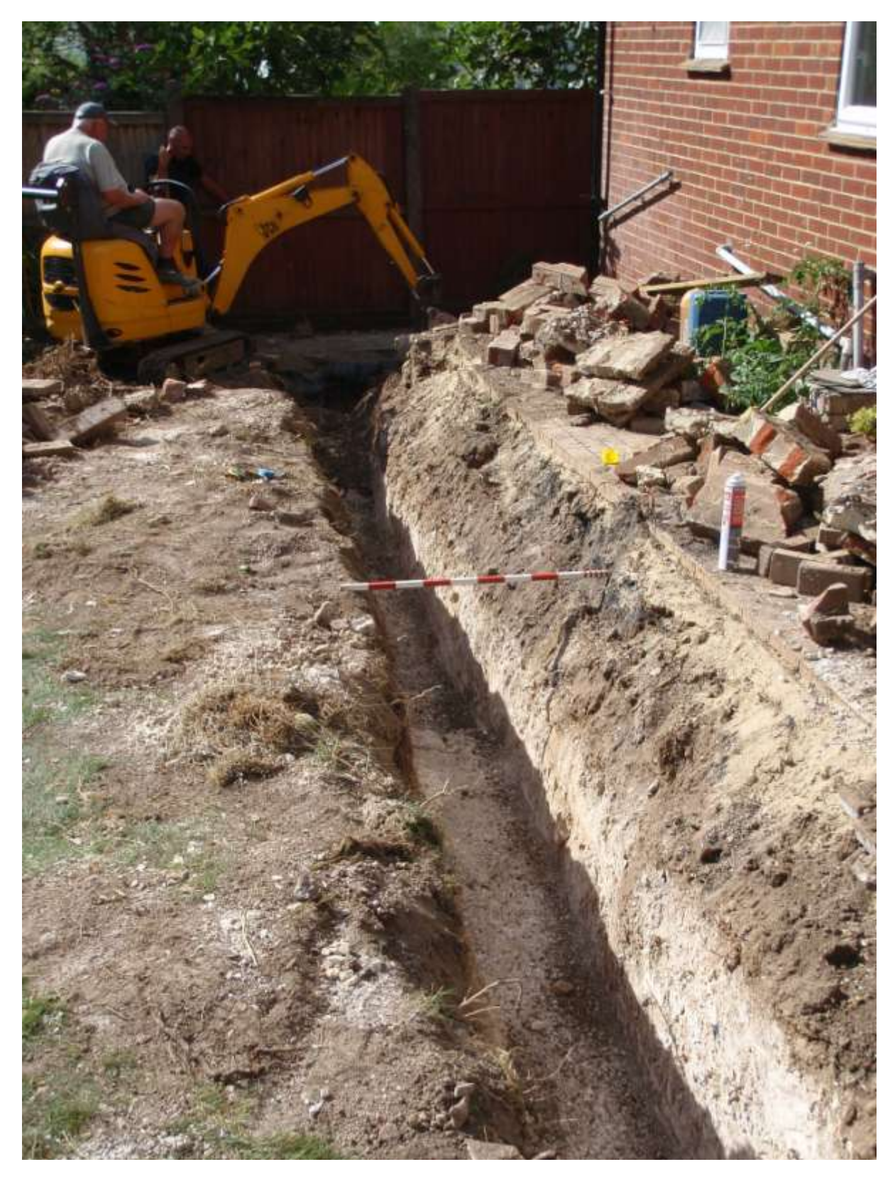
Plate 4- Trench 1- view of evaluation trench (looking NE)